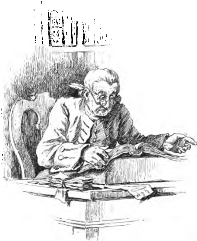
'A clerk put out his head.'

'Oh, sir, no doubt, compare as much as you please—no